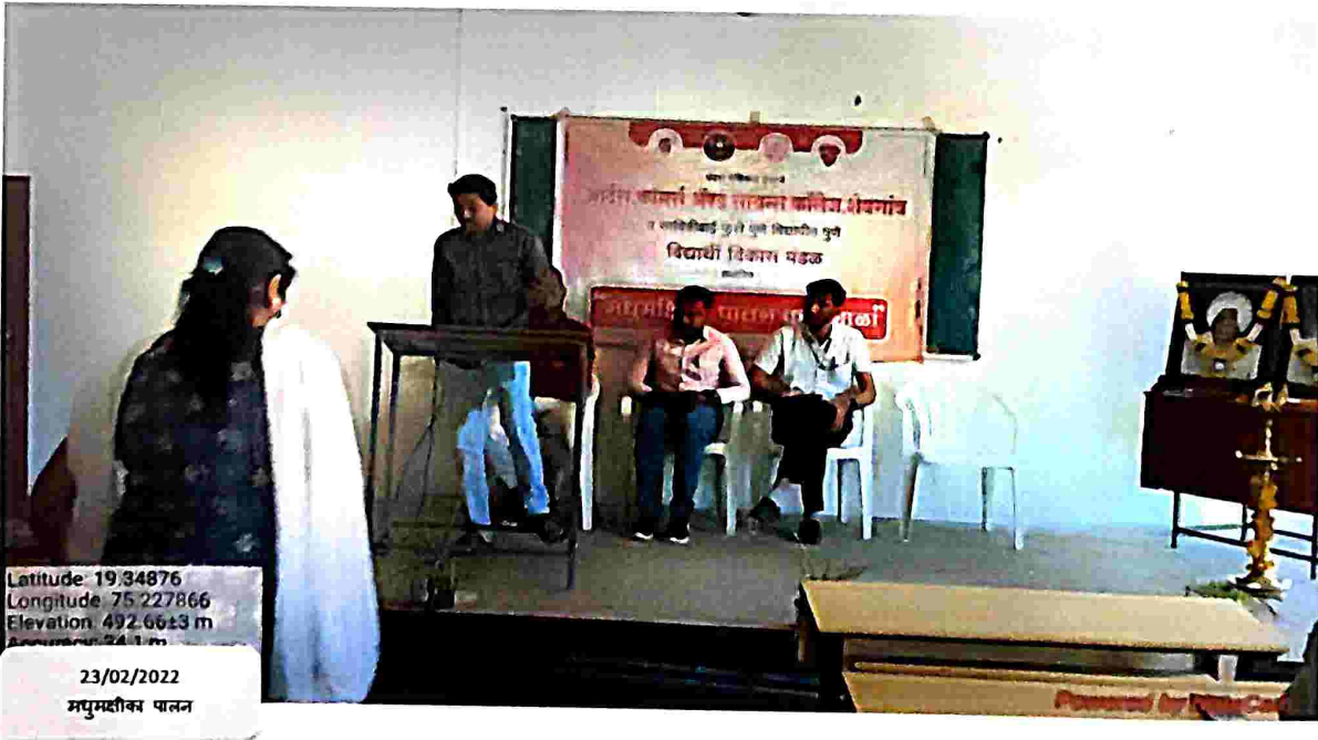
मधुमक्षिका पालन कार्यशाळा उपक्रम २०२२