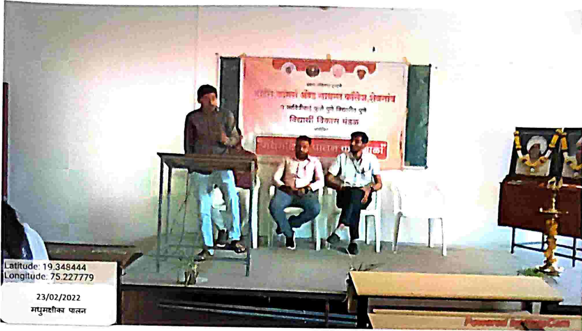
मधुमक्षिका पालन कार्यशाळा उपक्रम २०२२