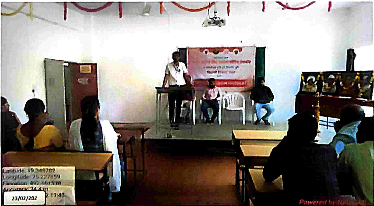
मधुमक्षिका पालन कार्यशाळा उपक्रम २०२१