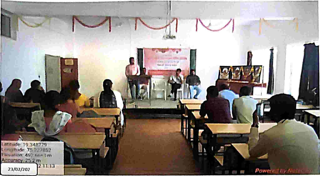
मधुमक्षिका पालन कार्यशाळा उपक्रम २०२१